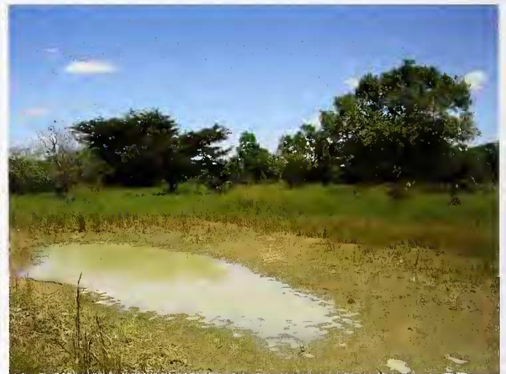
Fig. 4. Type locality of Nothobranchius seegersi , seasonal pool on right side of the main road T8 from Ipole to Rungwa, near Mabangwe village, Tanzania.

Nothobranchius neumanni : MSNG 56051A–B, 2 males, 52.7 & 57.3 mm SL; Seneki, Tanzania, 5°11'S, 33°17' E; MSNG 56052A–B, Sukamahela, Tanzania, 5°8'25" S, 32°46'44" E; 2 males, 37.9 & 47.8 mm SL. MSNG 56053, 1 male, 49.3 mm SL, C&S, Bahi Swamp – Lusilile TZ 2008–19, Tanzania, 5°53'S, 35°12' E; first authors private collection: 1 male C&S, 49.7 mm SL, Manyara area, Tanzania, 3°35' S, 35°50' E; 1 male C&S, 44.2 mm SL Tabora area, Tanzania, 5°1' S, 32°48' E; 1 male, 54.1 mm SL, Magiri, Tanzania, 4°55' S, 33°1' E; 2 males C&S, 47.8 & 52.8 mm, Bahi Swamp – Itigi, Tanzania, 05°53' S, 35°12' E; 1 male, 43.9 mm SL, Bahi Swamp–Lusilile, Tanzania, 5° 53' S, 35°12' E.